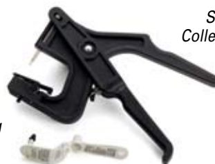
Sample Collection Tool

*Available for additional cost; see www.IGENITY.com or call 1-877-IGENITY for pricing details.