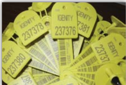
Sample Collection Tag